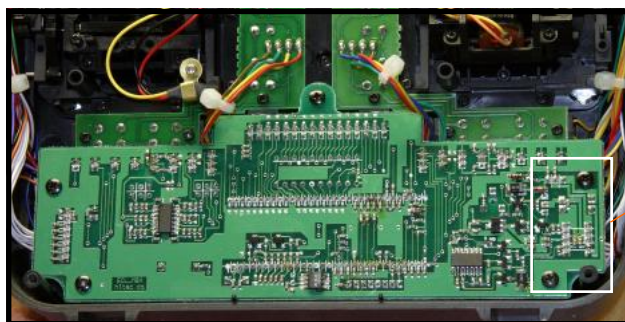
ILLUSTRATION: HITEC PRIZM 7 TRANSMITTER

Interior of Hitec Prizm 7 Transmitter showing the circuit board. Area outlined is shown as enlarged detail at right. (The diode is underneath the board.)